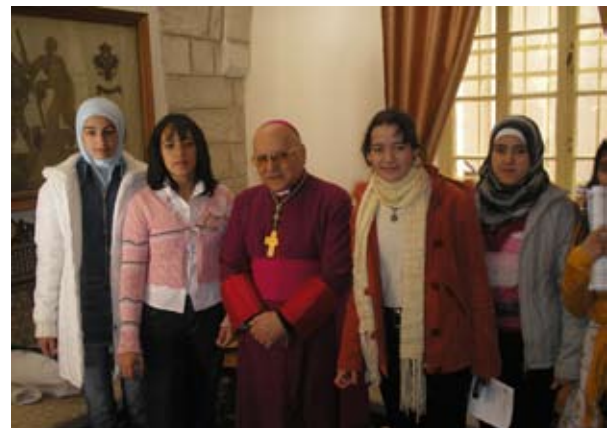
Hebron students interview a priest in Bethlehem.