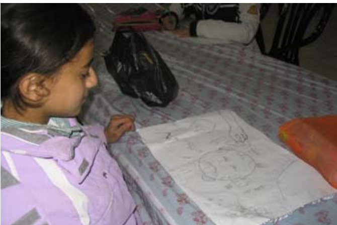
GCEP students create their own depictions of climate change and the many problems facing the world that have been provoked by global warming.

The first aim of our lesson plan was to teach students in Jenin, Ramallah, Bethlehem and Hebron what we mean by climate change, what the reasons for these phenomena are, and how they can prevent it. The students worked in groups to prepare presentations about climate change with information found by searching the Internet, visiting places in the community and interviewing company representatives. Each group then made their presentation to other class members about one of the specific areas outlined above. We asked students from Al-Najah school in Ramallah to provide their answers to the following questions for this newsletter – could you pass the test as successfully?