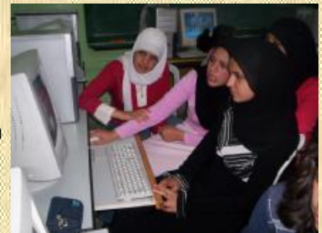
This summer holiday is the best with RI-SOL