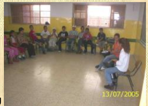
Right to play camp members enjoying their time with RI-SOL

The third part of enhancing summer camp, held training to 21 student which they are in a summer camp with right to play program supported from UNDP, on 10 th of July we gave them training on computer in our ILC at Alawda school around 4 hours, the training was about ms word, and they drew nice things on paint program, it was like entertainment and training for them.