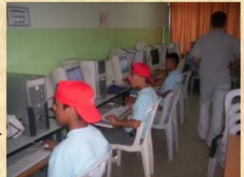
Boys from rehabilitation of victim torture

chance to work on computers during their rehabilitation camp. The youngest participants have learned how to turn the computer on, how to open an application, how to play educational games, and how to paste pictures. The older children have asked to be trained in the power point, Internet, and e-mail. All the participants