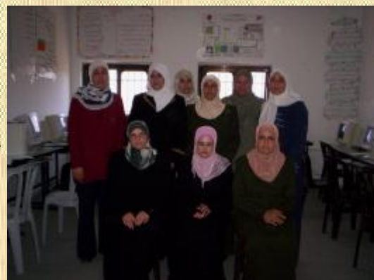
Computer not for youth only Ain Ybrod women said that

A ctive mothers, or Student Mothers Committee, from Ein Yabrod village reached out to the Internet Learning Center at the girls' school in Ramallah to ask for computer literacy training. Ein Yabrod, a small town placed 15 kilometers away from Ramallah, has successfully equipped its girls' school with a computer lab solely thanks to the active attitude and financial support from the local women. On July 16 th , all active members of Ein Yabrod's Student Mother Committee started their training led by RI-SOL's On-Site Monitor to gain basic IT skills, hardware and software maintenance and troubleshooting skills, and the management skills of the Internet Learning Center.