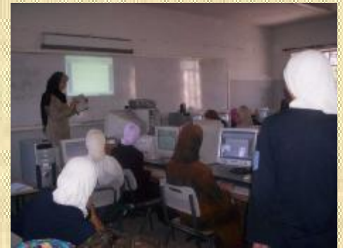
The girls from Hebron decided to learn animations