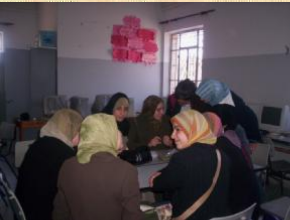
Wedad Naser Alden school students planning in groups to start work

“old” things to make new items rather than turning into buying a new item every single time. Through their own connections, students approached few University students from the Art Department to help them design the new objects. Twenty female students from the ILC gathered in the ILC to create vases, flower vases, and greeting cards.