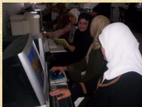
Real discussion between the participants to get best result

The training continued to take place each Saturday for 6 weeks. After the training, most women agreed to provide continuous financial support to the school lab. To supplement the skills of the SMC, RI-SOL opened its Ramallah ILC where the women can learn about the Internet. This training will continue in the upcoming months. The success of the training for women from Ein Yabrod spread across the area with a speed of light. Starting on August 17 th , fourteen women from Al-Bireh (a district neighboring with Ramallah) asked for a similar training.