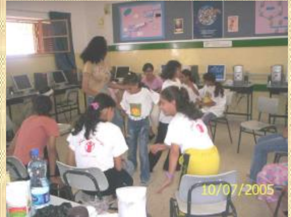
We find our family with RI-SOL

P artnerships between RI-SOL and local NGOs extended beyond the Global Youth Service Day implemented back in April. On July 4-10, the students of Alawda ILC (Bethlehem Secondary Girls' School), in coordination with the On-Site Monitor and the local community, organized a workshop for 12 children from the SOS Association, the main caretaker of orphan and homeless children in Bethlehem. The contact between the Bethlehem ILC and the SOS was first established in April during the Global Youth Service Day when the students visited the orphanage with a reading contest and fun activities. During the summer workshop organized at the ILC, the young children had an opportunity to leave the SOS house, to strengthen their new friendships, and to have some fun – all while gaining new technology skills. This one-week "educational vacation"