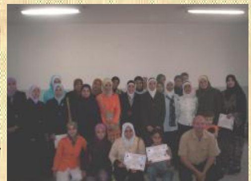
We pass the local exam and we are ready to get the International one

G etting the International Computer Driving License (ICDL) is a dream of most Palestinian youth and teachers. Those who possess ICDL improve their chances for finding a good job and a higher salary scale. However, the rates of those passing the international test are very low – either the courses don't do justice in preparation, or the test-takers need to study a little harder. Hebron ILC decided to reach out to the community by offering a course teaching the content of the ICDL program. With help from 5 student volunteers (those who previously participated in our online activities), thirty-five community members and five students from a neighboring school were able to attend the course. During the 42 hours, the total of 40 participants learned basics of Microsoft Office (word, excel, PowerPoint). The course ended with a joyful graduation party during which certificates were distributed.