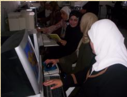
Real discussion between the participants to get best result

The training continued to take place each Saturday for 6 weeks. After the training, most women agreed to provide continuous financial support to the school lab. To supplement the skills of the SMC, RI-SOL opened its Ramallah ILC where the women can learn about the Internet. This training will continue in the upcoming months.