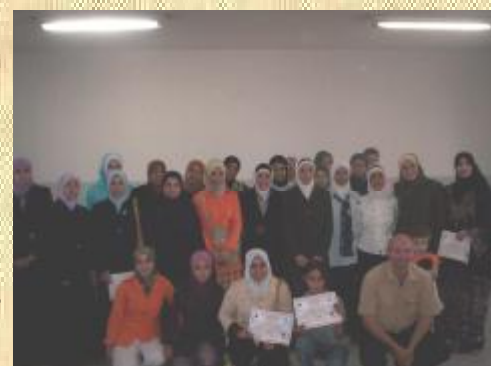
We pass the local exam and we are ready to get the International one

G etting the International Computer Driving License (ICDL) is a dream of most Palestinian youth and teachers. Those who possess ICDL improve their chances for finding a good job and a higher salary scale. However, the rates of those passing the international test are very low – either the courses don't do justice in preparation, or the test-takers need to study a little harder. Hebron ILC decided to reach out to the community by offering a course teaching the content of the ICDL program. With help from 5 student volunteers (those who previously participated in our online activities), thirty-five community members and five students from a neighboring school were able to attend the course. During the 42 hours, the total of 40 participants learned basics of Microsoft Office (word, excel, PowerPoint). The course ended with a joyful graduation party during which certificates were distributed.