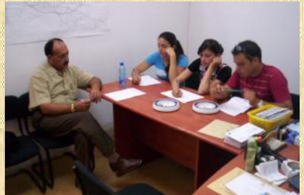
PYU groups in interview with the head of council to get information about Aboud

A similar cooperation continued with the Palestinian Youth Union in Ramallah. During the Global Youth Service Day, the PYU helped youth from the Alhashemya ILC paint and clean their school and to plant trees and plants in the school entrance. This summer, boys and the On-Site Monitor from the Alhashemya ILC wanted to do something in return for the youth from PYU. They agreed to work with the young members of the PYU to give them computer literacy skills, inclusive of browsing the net and using e-mail. Most of the PYU members had very limited or no computer skills, but within the several-day training course, they have learned to work in word, excel, and power point. Since the PYU's center currently lacks Internet connection, youth came to the Alhashemya ILC (Ramallah) to learn to navigate through the Internet. At the Alhashemya ILC, members of the YPU learned about the Global Connections and Exchange Program and immediately wanted to join the project - specifically My Community project. Divided into two groups, the youth collected information about the Aboud Village. They met with managers of the rural council, with doctors, school administrators, and shopkeepers. As a result, they prepared spectacular report and a website showcasing their work