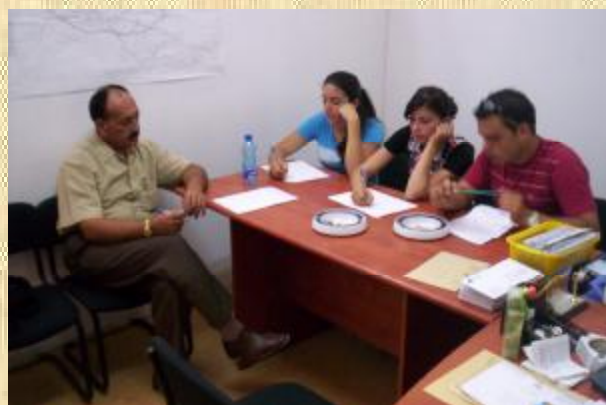
PYU groups in interview with the head of council to get information about Aboud

A similar cooperation continued with the Palestinian Youth Union in Ramallah. During the Global Youth Service Day, the PYU helped youth from the Alhashemya ILC paint and clean their school and to plant trees and plants in the school entrance. This summer, boys and the On-Site Monitor from the Alhashemya ILC wanted to do something in return for the youth from PYU. They agreed to work with the young members of the PYU to give them computer literacy skills, inclusive of browsing the net and using e-mail. Most of the PYU members had very limited or no computer skills, but within the several-day training course, they have learned to work in word, excel, and power point. Since the PYU's center currently lacks Internet connection, youth came to the Alhashemya ILC (Ramallah) to learn to navigate through the Internet. At the Alhashemya ILC, members of the YPU learned about the Global Connections and Exchange Program and immediately wanted to join the project - specifically My Community project. Divided into two groups, the youth collected information about the Aboud Village. They met with managers of the rural council, with doctors, school administrators, and shopkeepers. As a result, they prepared spectacular report and a website showcasing their work