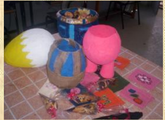
We can do more

Summer time in Hebron peaks with student creativity. In July, three most active students of the Wedad Naser Alden ILC (Hebron) came up with the idea of creating art and home items using old and seemingly useless materials such as newspapers, carton, crayons, or plastic cups. The main message they wanted to get through to the audience was to re-use and re-cycle old things. The students felt that by showing the multiple and creative uses of objects, they will be able to motivate others to use