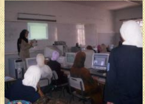
The girls from Hebron decided to learn animations