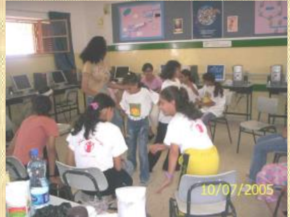
We find our family with RI-SOL

P artnerships between RI-SOL and local NGOs extended beyond the Global Youth Service Day implemented back in April. On July 4-10, the students of Alawda ILC (Bethlehem Secondary Girls' School), in coordination with the On-Site Monitor and the local community, organized a workshop for 12 children from the SOS Association, the main caretaker of orphan and homeless children in Bethlehem. The contact between the Bethlehem ILC and the SOS was first established in April during the Global Youth Service Day when the students visited the orphanage with a reading contest and fun activities. During the summer workshop organized at the ILC, the young children had an opportunity to leave the SOS house, to strengthen their new friendships, and to have some fun – all while gaining new technology skills. This one-week "educational vacation"