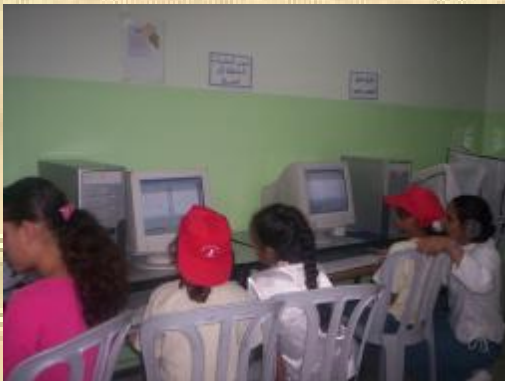
Girls from rehabilitation of victim torture

were running to the ILC each day for their one-hour training sessions. They expected to have fun during the camp, but they didn't expect to work with computers every single day. As in most cases, collaboration between Khawlah ILC and the Rehabilitation Center for Victims of Torture will continue in the upcoming scholastic year.