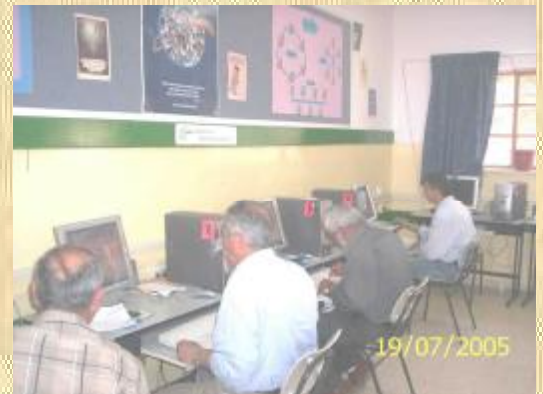
Men from Bethlehem training at Alawda secondary girls school

Alawda Secondary Girls' School put as its mission over the summer months to invite as many community groups and members as possible to use the center. But, it came as a big surprise to the ILC staff to see four men from the community who one day showed up at the center and asked for a course on basic computer skills. It was the first time in the history of Bethlehem that men attended a training course in a girls' school (usually men attend training courses at boys' schools). They have gained basic Microsoft office skills during a 14-hour training distributed over seven days. The school principal and the On-Site Monitor were very excited and hope that this incident will set a precedent for the rest of the community to see the ILC as a resource that exists to serve them.