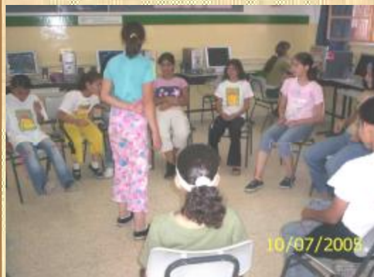
Kids from SOS association entertain with us and learning on computer programs

Page 6: hand made & student from other schools