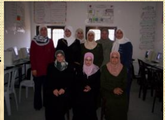
Computer not for youth only Ain Ybrod women said that

A ctive mothers, or Student Mothers Committee, from Ein Yabrod village reached out to the Internet Learning Center at the girls' school in Ramallah to ask for computer literacy training. Ein Yabrod, a small town placed 15 kilometers away from Ramallah, has successfully equipped its girls' school with a computer lab solely thanks to the active attitude and financial support from the local women. On July 16 th , all active members of Ein Yabrod's Student Mother Committee started their training led by RI-SOL's On-Site Monitor to gain basic IT skills, hardware and software maintenance and troubleshooting skills, and the management skills of the Internet Learning Center.