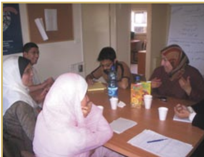
Students and RI-SOL staff planning this year's camp at RI-SOL's office in Ramallah

The summer camp will be divided into two segments. The main part will include training on various computer programs, volunteerism and a field trip. The second half of the camp is an "English Club," which will have several activities to improve language skills in writing and conversation, and is designed to enable the students to have fun while learning. Duration of the camp will be 12 days, and 15-20 students will participate in each city from different schools. The students who helped develop the plan will also assist us during camp as group leaders.