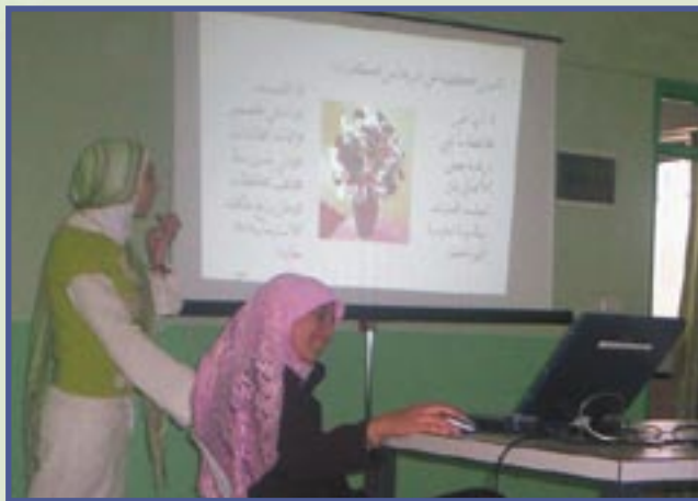
Students presenting their research projects at Khawlah School in Ramallah

On May 30, 2006, students from Khawlah Secondary Girls School presented their final research projects for their Technology Culture class. The projects built on the skills that students learned during the year through GCEP, showing how the program affected their understanding of their societies and their curriculum. The students also demonstrated how the Internet served as an invaluable tool in creating their final projects.