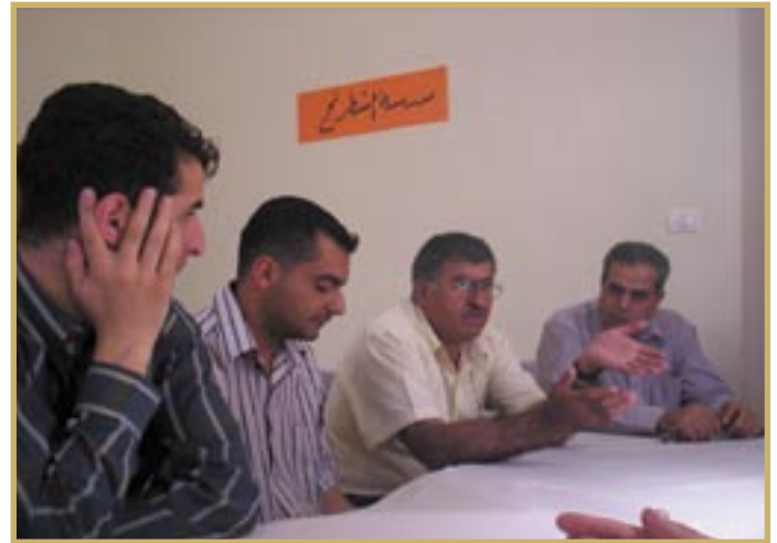
RI-SOL and EbdAA' staff meet after a fundraising luncheon to discuss plans for the new center

As a result of RI-SOL's success in working with students and communities in the "First Center of Excellence" in Jenin, RI-SOL is opening a second community-based learning center in Hebron, in cooperation with the local NGO EbdAA' ("creativity" in Arabic). RI-SOL is also working with other local youth NGOs to open a second community center in Hebron. To debut the center to the Hebron community, RI-SOL held a fundraiser luncheon on June 8, 2006. Staff members from Ramallah, Bethlehem and Hebron attended the luncheon and met with community members, as well as local Hebron businesses and NGOs.