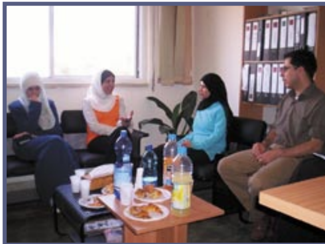
Public school students from Khawlah School in Ramallah discuss the future of GCEP with RI-SOL staff

During the last few months of our project, a few students who are graduating from our participating schools have demonstrated the impact of GCEP by asking to become volunteers with GCEP and RI-SOL. To brainstorm ideas, we arranged a meeting with several of the youths and discussed with them their ideas for the program in the future.